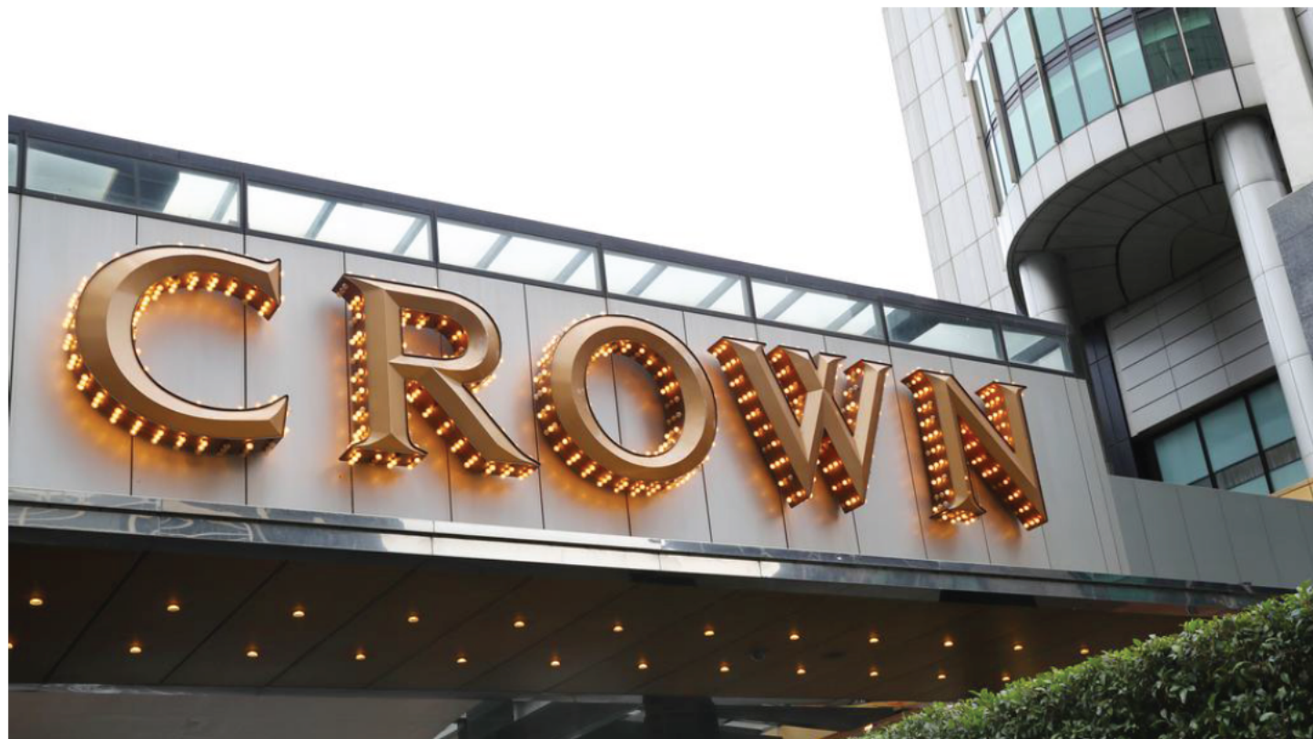
Jake Salantri peddled drugs at Crown Towers after winning more than $500,000 playing poker.

A druggie punter's only excuse for buying a two kilo smorgasbord of drugs after winning more than half-a-million playing poker at Crown casino was simple — "who wouldn't".