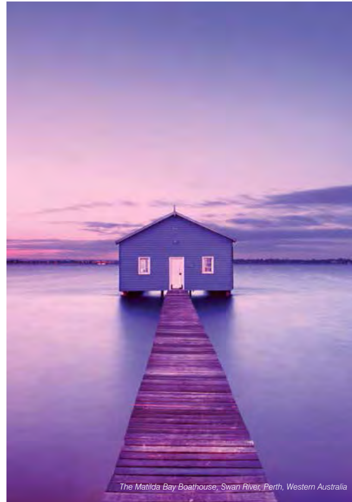
The Matilda Bay Boathouse, Swan River, Perth, Western Australia