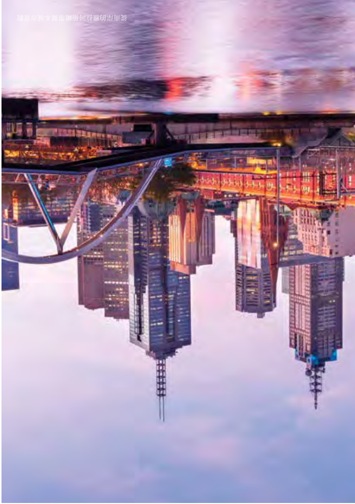
從南岸的維拉河俯瞰墨爾本城市景觀