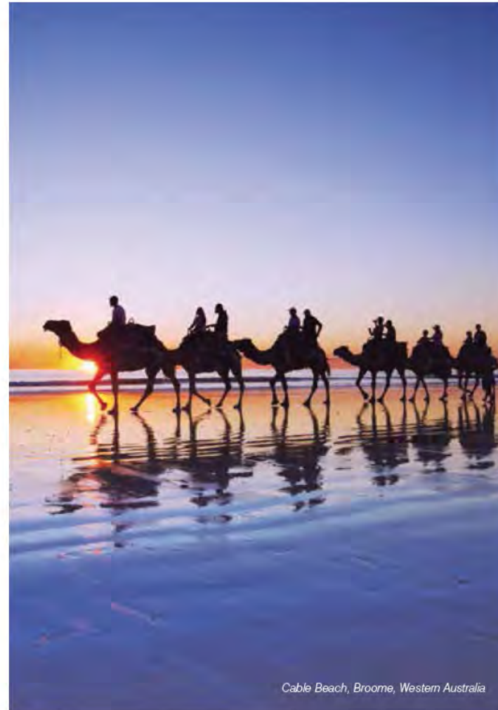
Cable Beach, Broome, Western Australia