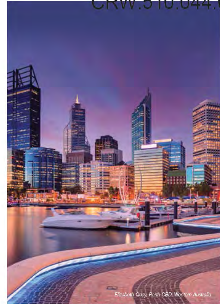
Elizabeth Quay, Perth CBD, Western Australia

Source: QS World University Rankings® 2018