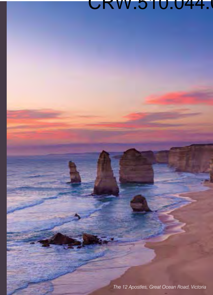
The 12 Apostles, Great Ocean Road, Victoria

Australia is a unique and diverse country rich in culture, population, climate, geography and history. It is a multicultural and multiracial nation offering excellent value for money and a standard of living which is among the highest in the world. The climate throughout Australia is generally temperate for most of the year with the northern state experiencing typically warm weather all year round, whilst snow falls on higher mountains during the winter months, enabling skiing in southern New South Wales and Victorian ski resorts. Australia offers a high quality of life due to low pollution and plenty of fresh air, along with world class dining, stunning natural landscapes and beautiful beaches along the coastline.