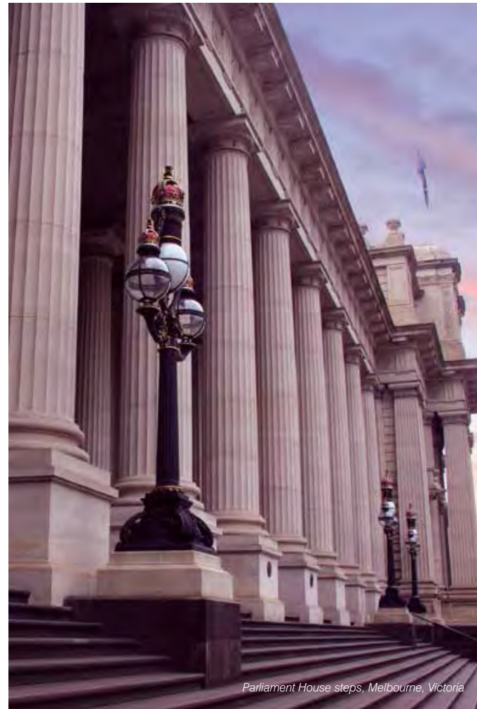
Parliament House steps, Melbourne, Victoria

Note: An individual enrolled in more than one course will count as multiple enrolments