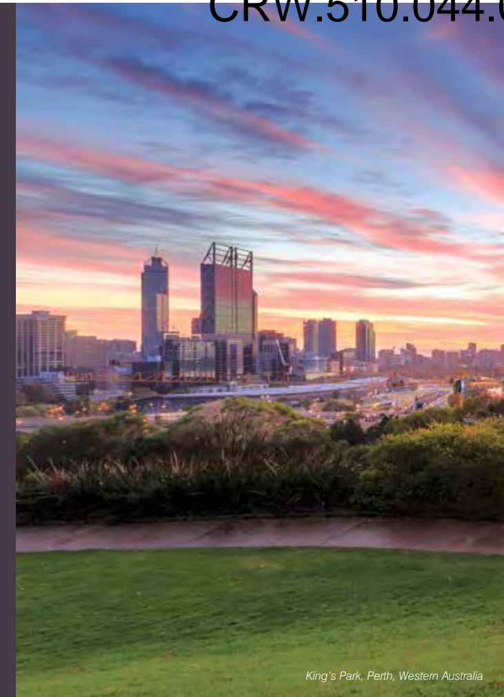
King's Park, Perth, Western Australia