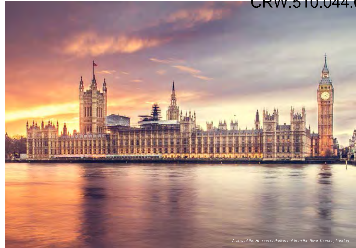
A view of the Houses of Parliament from the River Thames, London